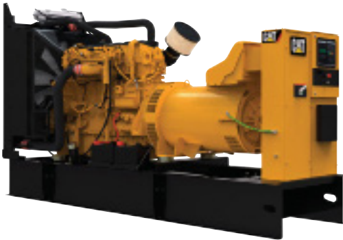
Image shown may not reflect actual package.